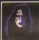
Ace Frehley (September 1978)