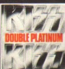
Double Platinum (April 1978)