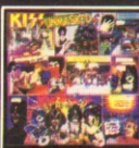
Unmasked (May 1980)