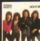
Lick It Up (September 1983)