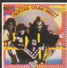
Hotter Than Hell (October 1974)