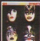
Dynasty (May 1979)