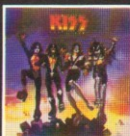
Destroyer (March 1976)