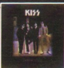
Dressed to Kill (March 1975)