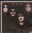
KISS (February 1974)