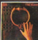
The Elder (November 1981)