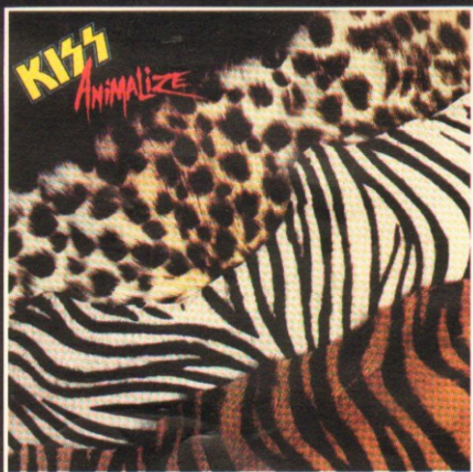
Animalize (September 1984)