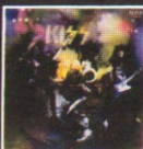
Alive (September 1975)