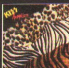
Animalize (September 1984)