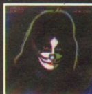
Peter Criss (September 1978)