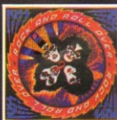
Rock & Roll Over (November 1976)