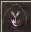
Gene Simmons (September 1978)