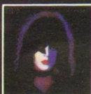
Paul Stanley (September 1978)