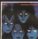
Creatures of the Night (October 1982)