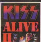
Alive II (October 1977)