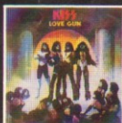
Love Gun (June 1977)