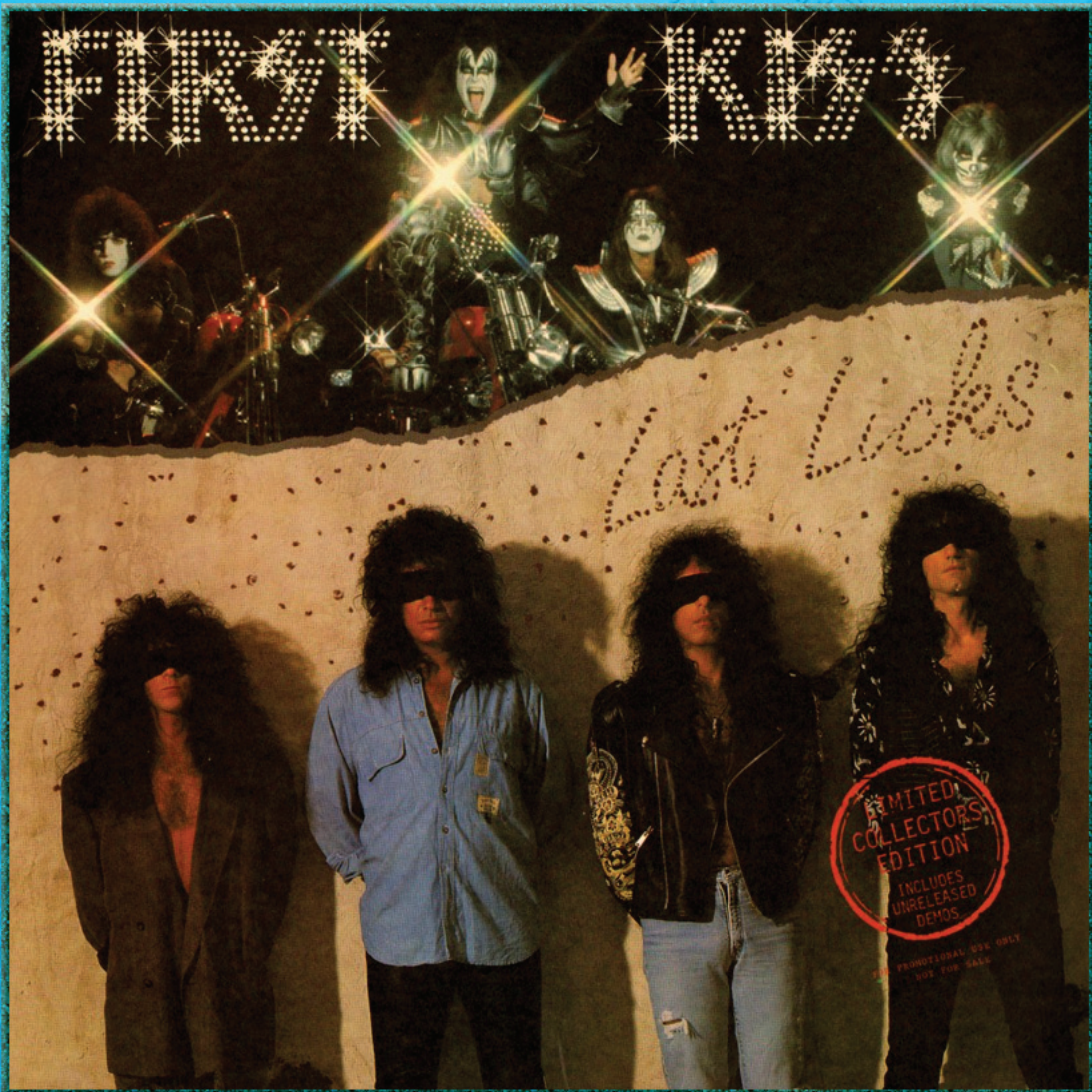
US "FIRST KISS, LAST LICKS" Promotional Album